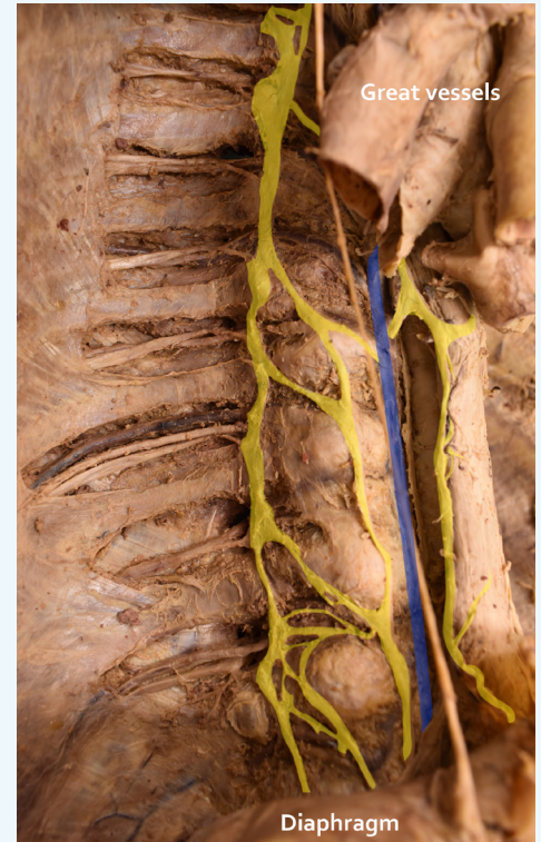
Splanchnic nerves and azygos vein on posterior thoracic wall